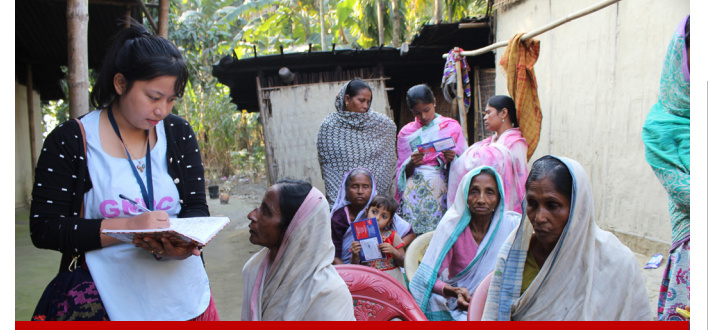
GNRC - Delivering integrated and affordable healthcare to the most vulnerable