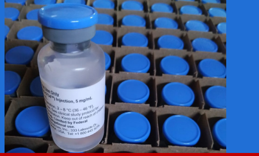
AWL India - Expansion of tech-enabled, on-demand supply chain